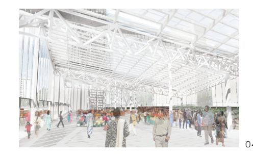
Figure 2: Carapace: Recycled Automotive Glass

Figure 3: Greenhouse and Community Space